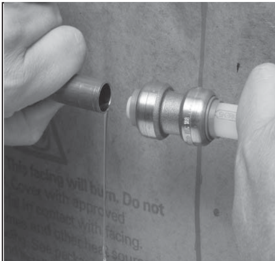
WET OR DRY REPAIRS