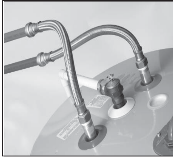
WATER HEATER CONNECTORS