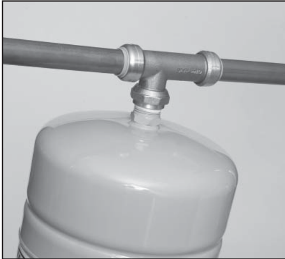
ADD NEW SERVICE LINES & EQUIPMENT