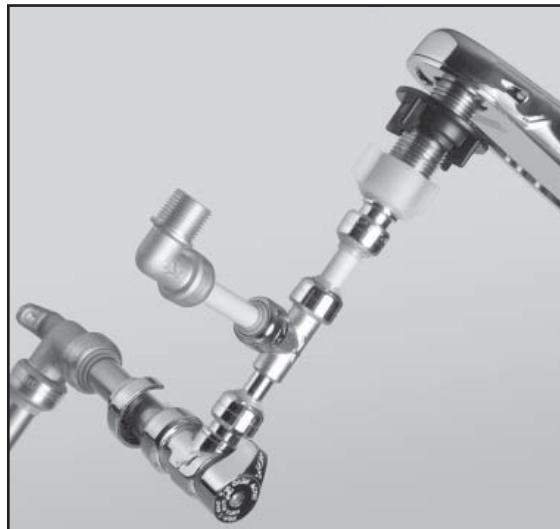
SHARKBITE SUPPLY LINE FITTINGS & STOPS